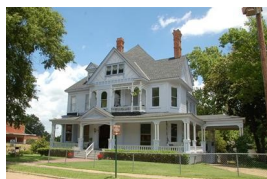
The Logan Mansion

In the historic downtown district, you will visit the oldest surviving church in Shreveport (built 1899), the Holy Trinity Catholic Church with its 85 stained glass windows, unequalled in splendor. Touring two stunning homes restored to the opulence of their era is also on the agenda. The Logan Mansion and the Davis Homeplace are private residences filled with antiques, great stories, and even a ghostly spirit or two! One is totally different than the other. This is an afternoon you will truly enjoy.