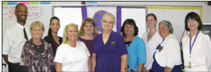
Welcome – Sigma Chapter, Upsilon State/SC

It is wonderful to be included in new member activities, and I hope all state and local chapters are promoting membership.