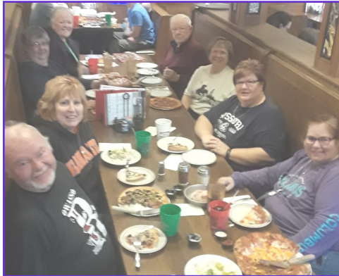
Kappa Volunteers enjoying a lunch break at the Hide Away Pizza!