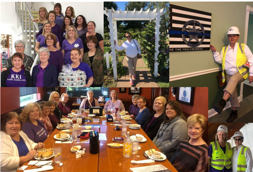
Photo Memories of Presidential Travels:

I have thoroughly enjoyed my visits to Arkansas, Texas, Georgia, Florida and will be visiting South Carolina, Alabama, and Missouri this spring. It was a pleasure to initiate new members in Texas and Georgia and talk with prospective members in Arkansas. It is a pleasure to serve as your National President and I look forward to seeing you all at the 2020 National Convention in Memphis, Tennessee, June 22-26, 2020.