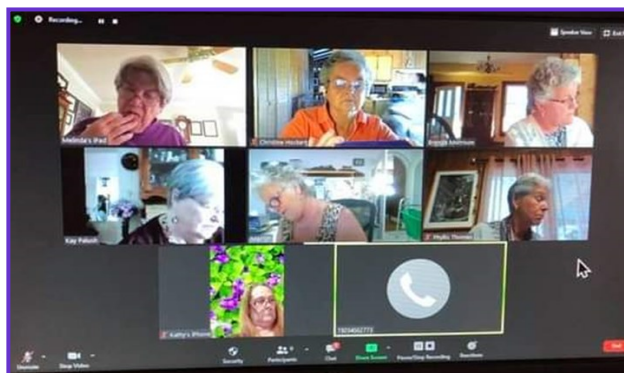
"Kappas Reaching for the Stars ~ Making a Difference" National Executive Committee Fall Meeting via Zoom