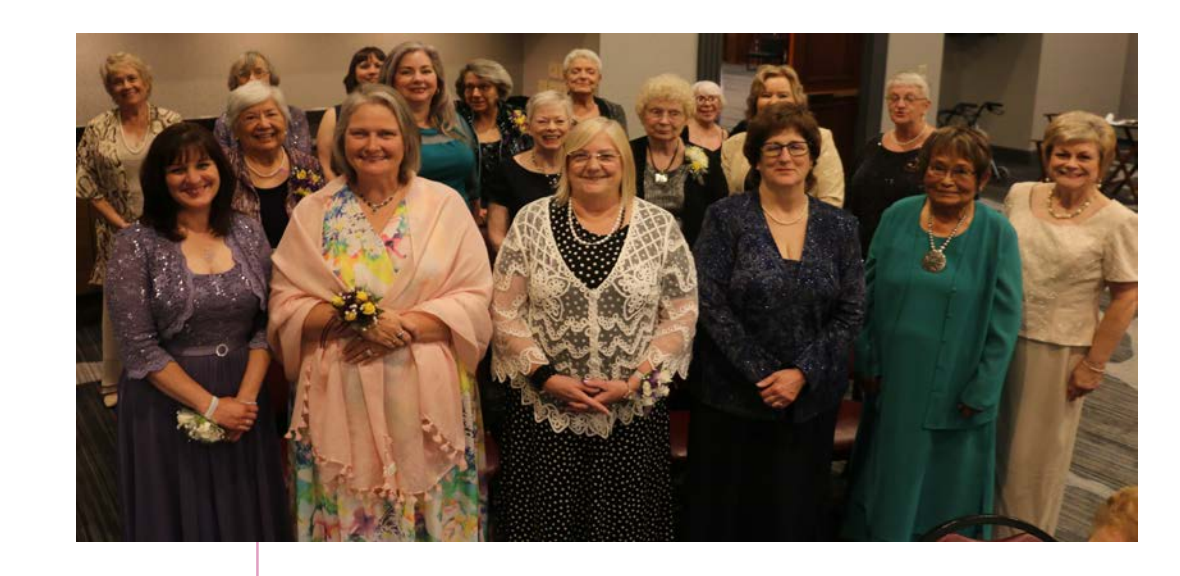
State Presidents' Installation Ceremony