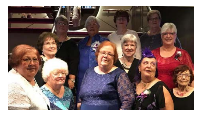
Past National Presidents Attending the Convention Cruise