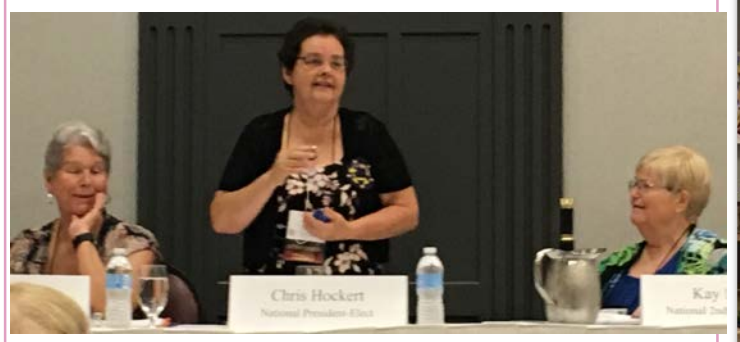
Second General Assembly