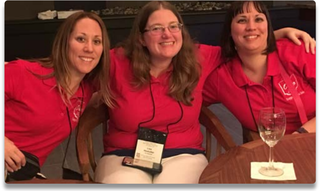
Sharing National Convention Experiences With a First Timer