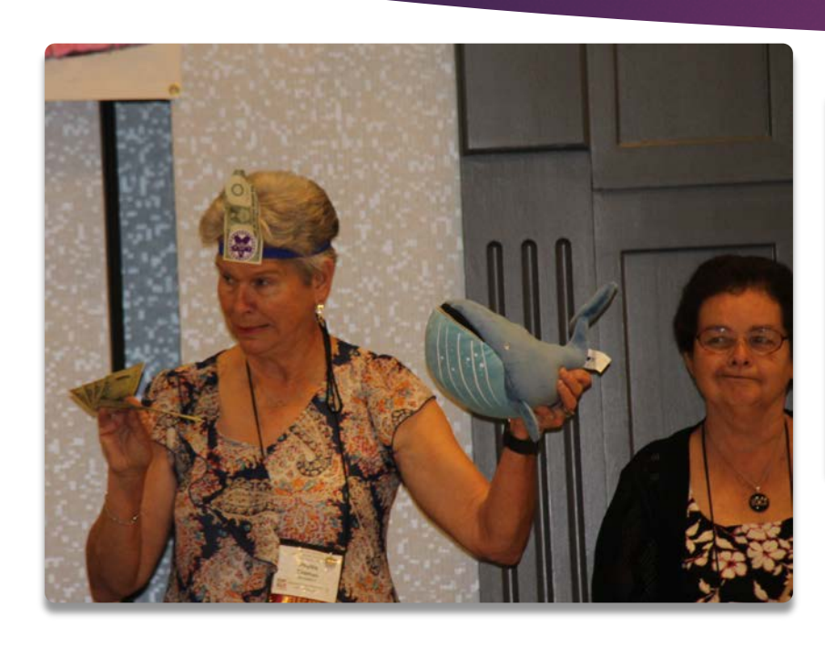
Executive Committee Fundraiser Skit