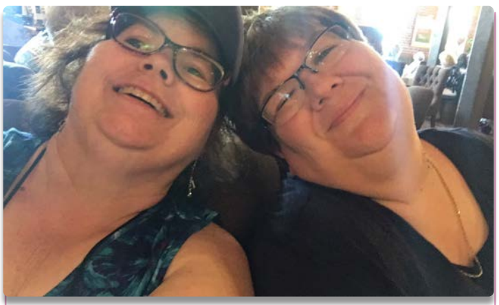
Everyone is Welcome on Tours