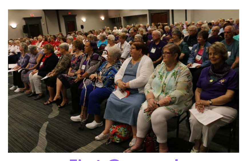
First General Assembly