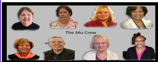
The Mu Crew

First the chapter president created a dedicated email account with Gmail. This email address is used for updates on the chapter's website www.muchapterlambdastate.wixsite.com/mukappas . This email account is also used to send chapter / Kappa specific information to chapter members. Next the chapter president created a private page through Facebook which is only open to members of MU Chapter. Only members of MU Chapter Lambda State are allowed use of this page. Specific questions must be answered before members can use the Facebook page. The page administrator checks activity daily. Finally ZOOM meetings are created for potential members to attend to meet us, greet us, get to know us, and learn about Kappa. After a potential member attends a session, they send a message to the chapter president about their desire to join Kappa. The Mu Crew can then offer an invitation to join Kappa Kappa Iota. Smartphones, Emails, Text Messaging, Instant Messaging, Facebook, and ZOOM are tools to use with a Virtual Chapter .